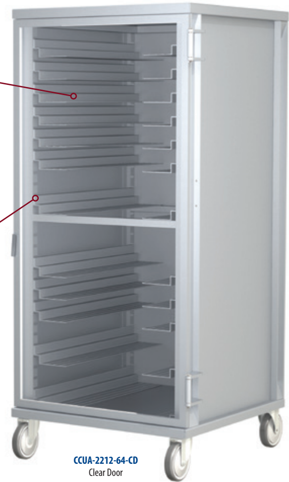
CCUA-2212-64-CD Clear Door